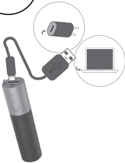
Charging your PowerBank