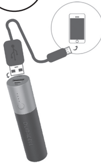
Charging your device