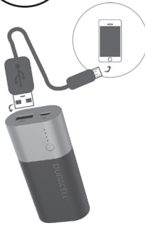
Charging your device