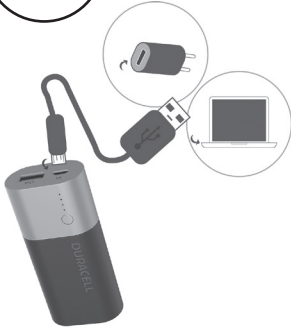
Charging your PowerBank